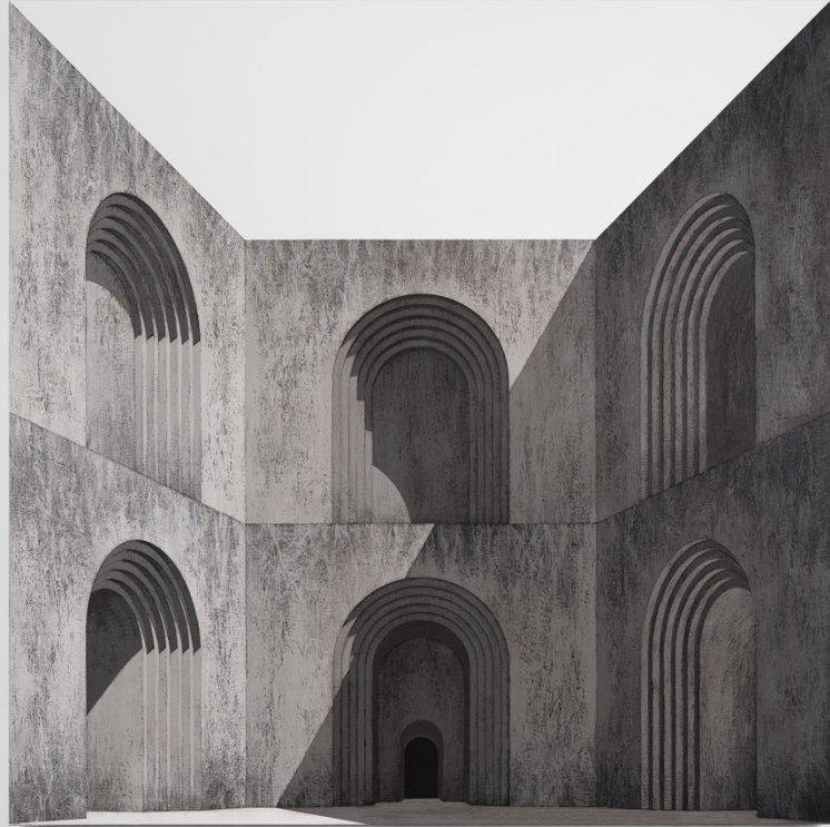
雷纳托·尼科洛迪 Renato Nicolodi 六边形神庙 I AEDES HEXAGONA I 布面丙烯 Acrylic on canvas 140 x 140 x 3.5 cm 2024