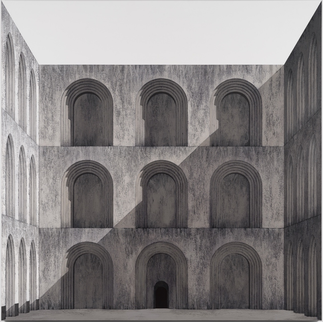
雷纳托·尼科洛迪 Renato Nicolodi 矩形神庙 I AEDES QUADRATA I 布面丙烯 Acrylic on canvas 203 x 203 x 3.5 cm 2024