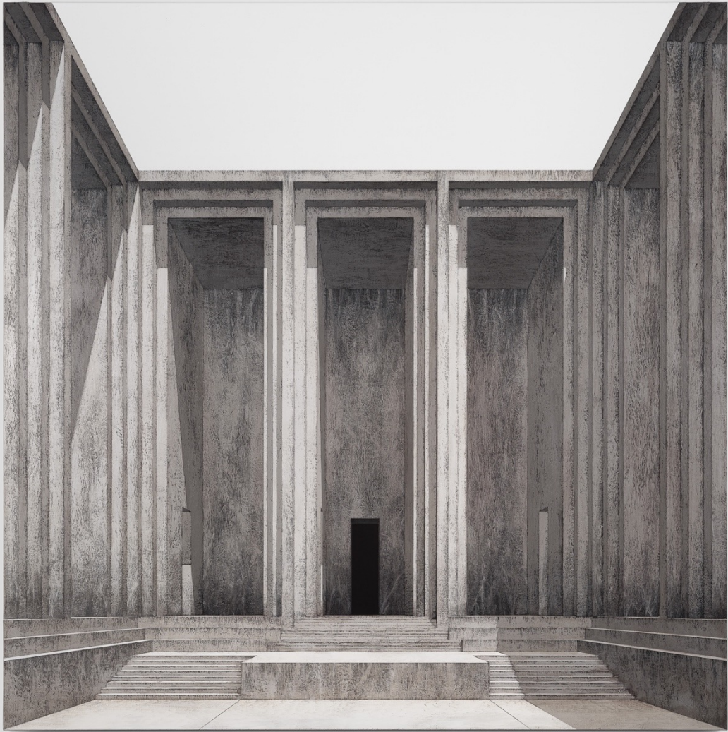
雷纳托·尼科洛迪 Renato Nicolodi 对称圣堂 III PORTICUS IN ANTIS III 布面丙烯 Acrylic on canvas 175 x 175 x 3.5 cm 2024